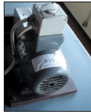
Pos. 828 11 Dual Mechanical Test Tables , with exhaust system