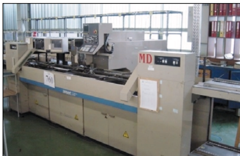
SOLD TDK VC-5A VC 5280R manufactured 04-1989