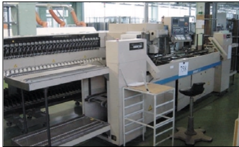
SOLD TDK VC-5B VC 5480R manufactured 03-1990